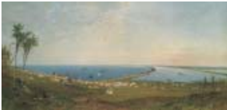
Duluth, Minnesota, 1871, oil on canvas, 25 x 50"; Collection of City of Duluth, Duluth Public Library, Minnesota