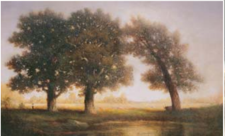
Fontainebleau (Three Trees) , n.d. (ca. 1901), oil on canvas, 28 x 36"; Collection of Tweed Museum of Art, Gift of Miss Melville Silvey

Munger painted this work in America after sixteen years of living and painting in Europe, and it certainly bears the stamp of the French Barbizon aesthetic. The softness, moodiness and latent emotionalism of the "portraits of trees" and forest interiors painted by Rousseau, Diaz de la Pena, Daubigny and others practitioners of the Barbizon style had a strong effect on all the work Munger produced after the early 1880s.