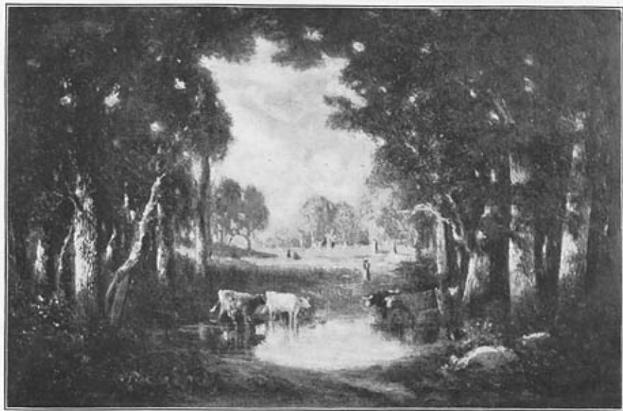
Forest of Fontainebleau