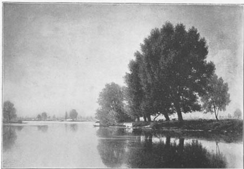
On the Seine near Poissy