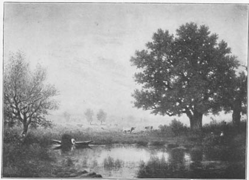
Border Forest of Fontainebleau